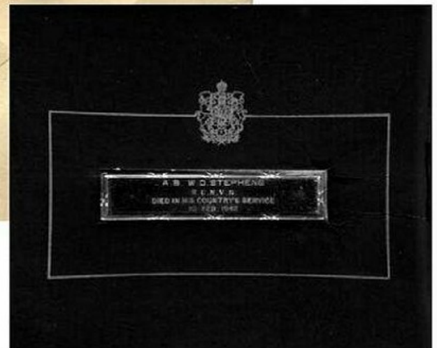
The Memorial Bar